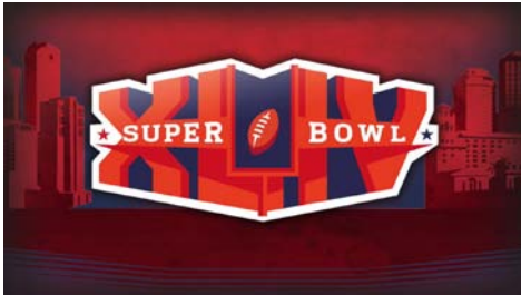
Client: ESPN Media: Vizrt, Photoshop