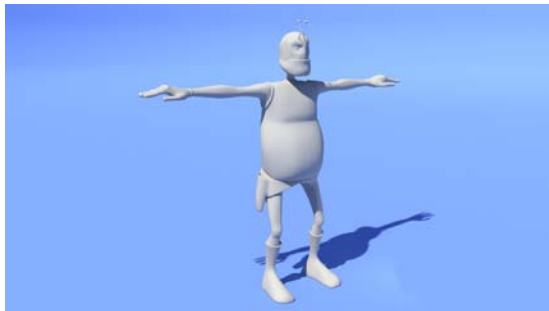
Client: Personal Media: Maya