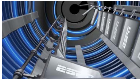
Client: ESPN Media: Vizrt, Photoshop